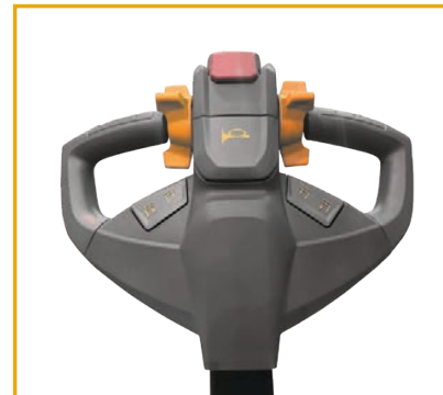
Handle (Standard) (Left & Right Handed)