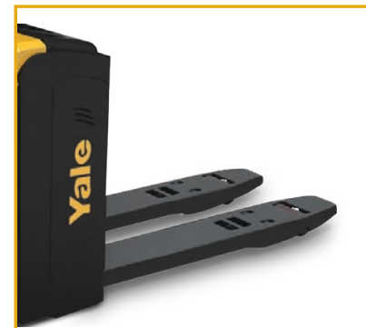
Entry roller for easy operation