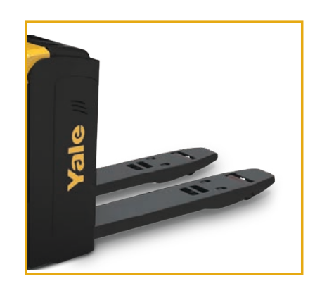
Entry roller for easy operation