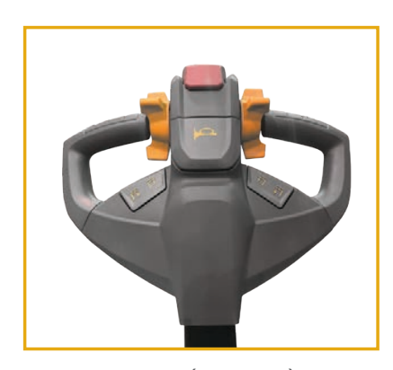
Handle (Standard) (Left & Right Handed)